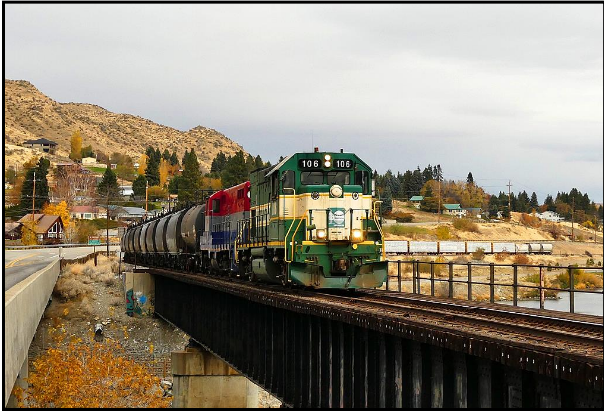
Cascade & Columbia River's SB Wenatchee Turn crosses the Entiat River Bridge south of Entiat, WA