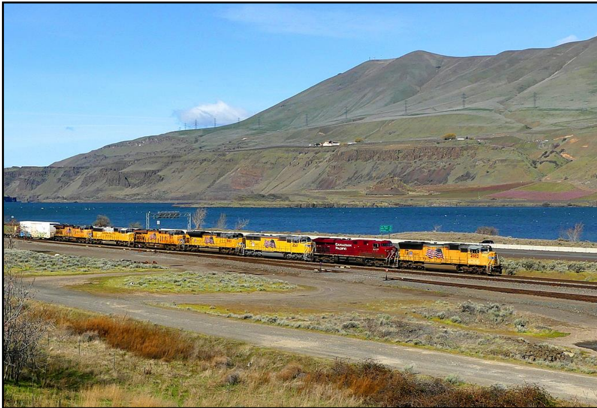
UP SD70M #4982 leads 6 other engines eastbound along UP's Portland Subdivision at Rufus, OR