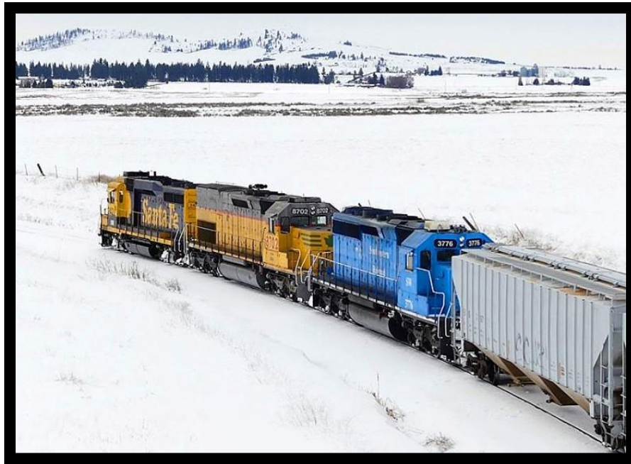
Washington Eastern Railroads 3 motors descending into Deep Creek. Soon they will assault the 1-2% grade up the other side.