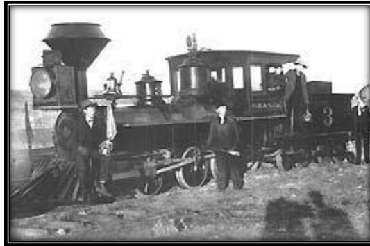
"Blue Mountain" locomotive ran on Walla Walla & Columbia Railroad

used wooden rails. Strap iron was placed on top of the wooden rails to improve the longevity of the rails. The strap iron was secured in place by nails. Rawhide was used when a quick repair was needed to secure a snakehead.