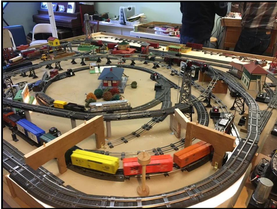
Ty Anderson's American Flyer Layout on Bainbridge Island