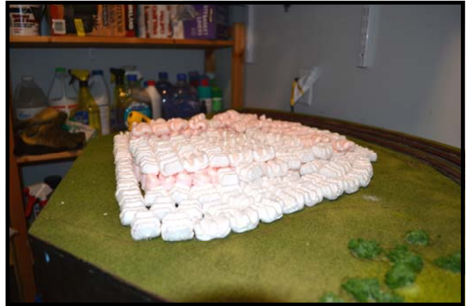
I continued to glue pellets until I had the basic shape.