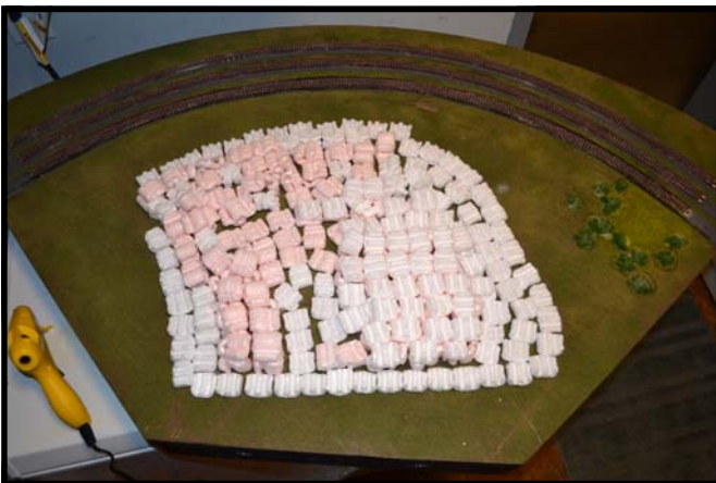
I began by hot-gluing a layer of Styrofoam packing pellets.