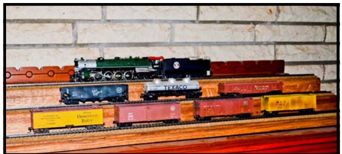
With Other Freight Cars and Motive Power Bought in Early 1970s