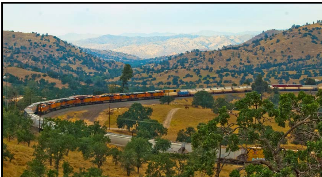
Tehachapi Loop ~ July 2019