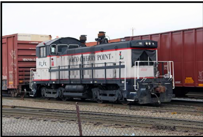
Prototype photo submitted by Peter Bieber