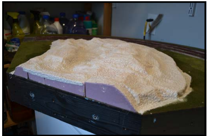
Next the basic shape was covered with plaster cloth.