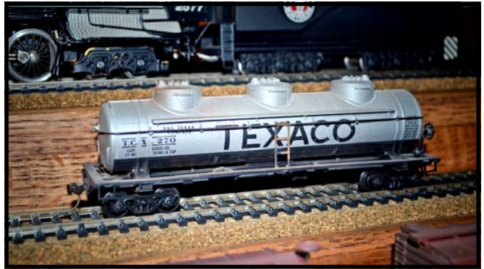
My First HO Scale Freight Car January 20, 1970