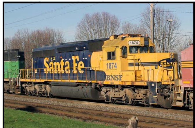
Prototype photo submitted by Peter Bieber