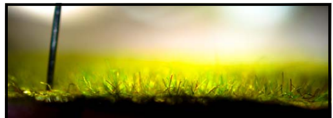
2mm static grass. A typical T-pin shaft is visible on the left. Photo made with a Nikon 40mm Micro Lens.