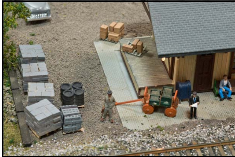
Waiting for the next train.

Watch your email and the website for news and updates about meetings, clinics, and clubhouse status.