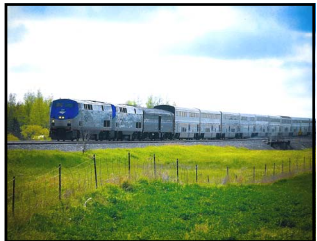
Prototype photos by Russell West