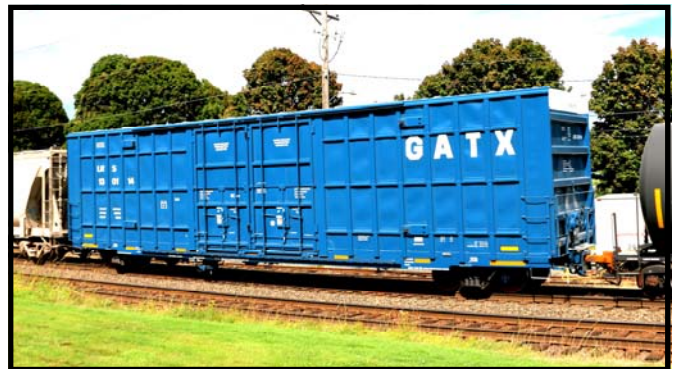
Prototype photo by Pete Bieber