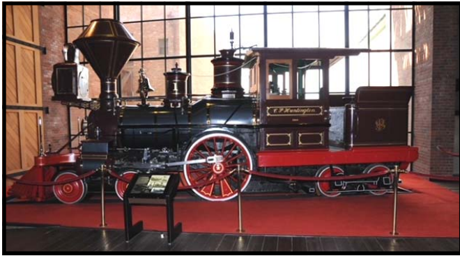
Central Pacific Locomotive #3, the CP Huntington, became the Southern Pacific's locomotive #1. On display at the California State Railroad Museum in Old Town Sacramento.