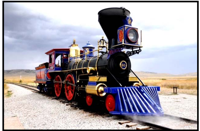
Above: Central Pacific #40, the Jupiter Below: Union Pacific Locomotive #119 seen at Promontory Point, Utah

These are reproductions, the originals were sold and later scrapped - neither the SP nor the UP companies realized the historical significance! The reproductions were completed in the 1970s. Both are now in the care of the National Park Service