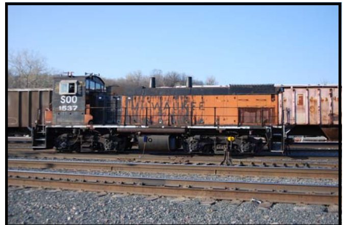
Prototype photos by Pete Bieber