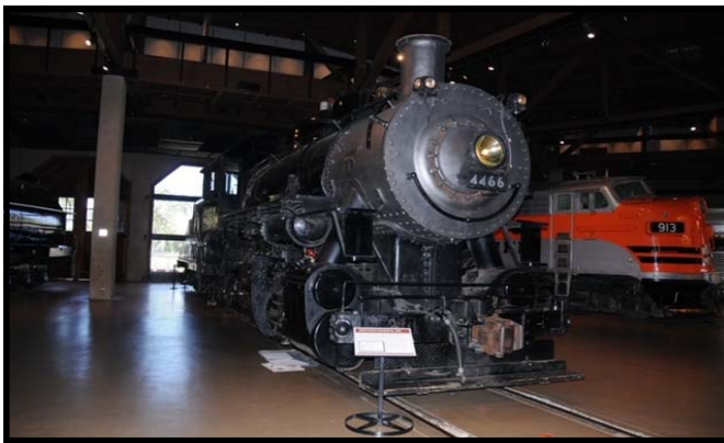
Union Pacific Locomotive #4466, was a shop switcher at Cheyenne, Wyoming and was the last steam switcher stationed there. On display at the California State Railroad Museum.