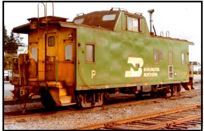
Steve's photo of the prototype BN caboose that inspired his model.