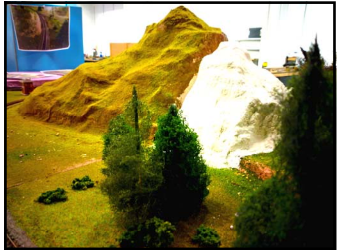
Photo 1: The portion in white is the mountain part on the Corner Lake module in plaster cloth before painting and application of ground foam. There was a rather wide gap between the two mountain pieces that needed to be dealt with.