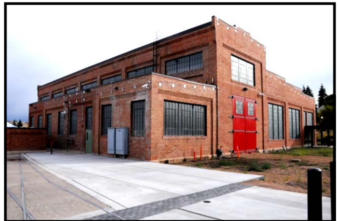
Photos of the Union Pacific machine shop, roundhouse, and power plant at Evanston, Wyoming. These buildings are now owned by the City of Evanston. They are undergoing restoration and conversion for events and as a museum facility.