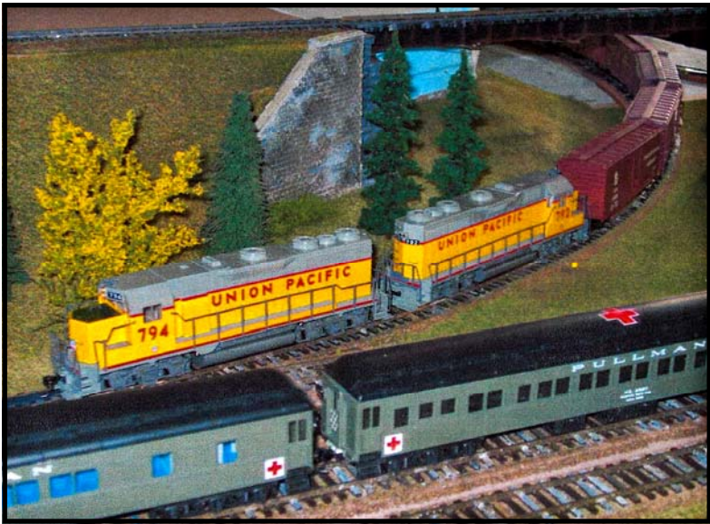
Left: “Rick’s Union Pacific freight ease out of the fiddle yard and onto the lead while Reed’s heavyweight hospital train glides through Central Valley on the Bremerton Northern’s new layout. Central Valley is the only scenic area of the layout.”