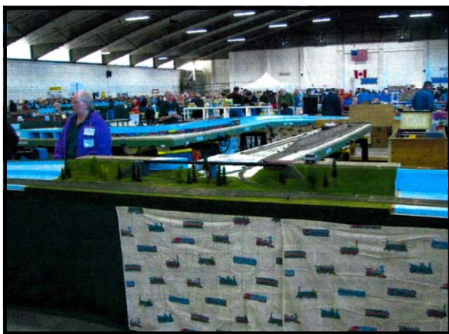
“The start of our scenery on the new layout.”