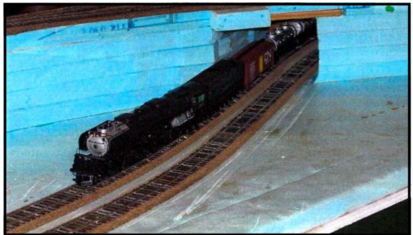
Right “Tom Barrett’s Challenger powered freight blasts out of tunnel #1 during its run around the layout.”