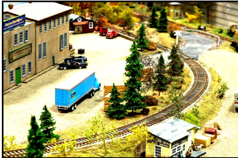
BNMR layout photo submitted by Mike Bay.

Watch your email and the website for news and updates about meetings, clinics, and clubhouse status.