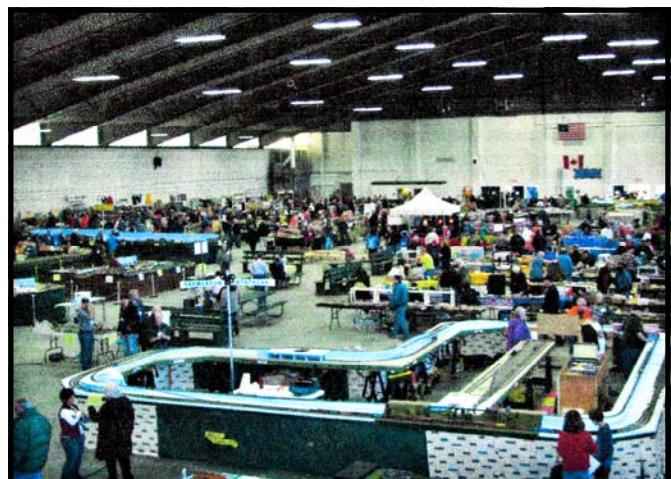
“A bird’s eye view of the new layout at Monroe 2012.”