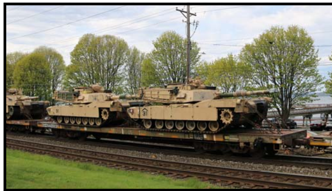
Prototype