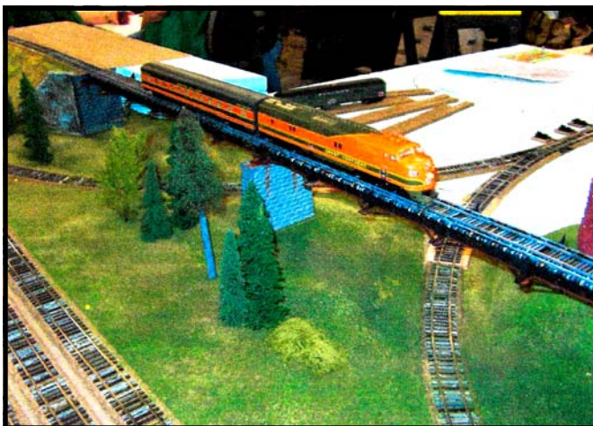
Left: “Paul’s GN passenger local eases across the as yet unfinished Central Valley Bridge. The future roundhouse site is in the background.”