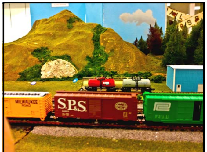
Photo 2: Both parts of the mountain have been painted, ground foam applied, and Pete has begun applying rock castings and scenery materials. The gap has been covered with foliage and bushes. Trees need to be made as well as more rock castings and scenery material must be applied.