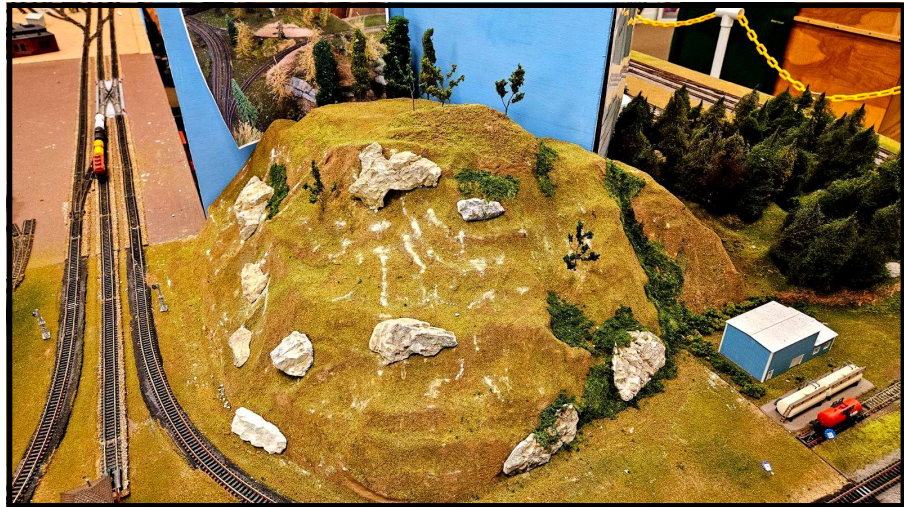
Pete has been progressing work on the north hill on the NTRAK layout at the Central Junction module.

Watch your email and the website for news and updates about meetings, clinics, and clubhouse status.