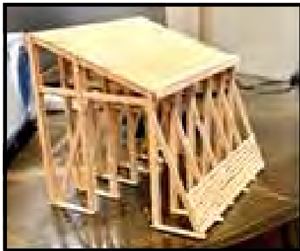
A completed Snow Shed