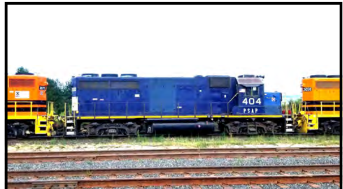
Puget Sound & Pacific GP40.